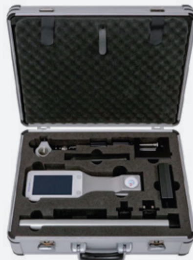
The PXL PLATINUM 330 comes in a sturdy transport case.