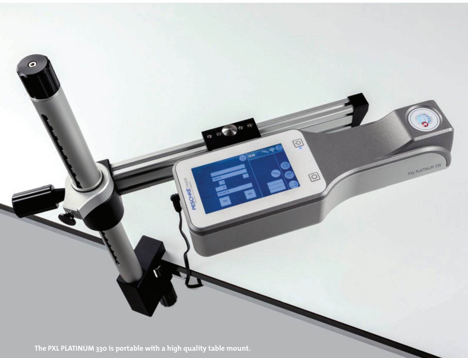
The PXL PLATINUM 330 is portable with a high quality table mount.